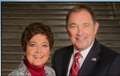
Former Governor Gary R. and First Lady Jeanette Herbert

Honoring the 2021 Resilient Utah Shield Award Recipients