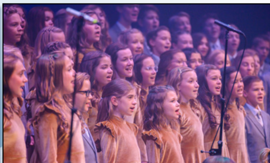
Rise Up Children’s Choir