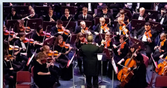
Lyceum Philharmonic Orchestra